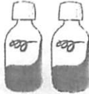
Two bottles of CLENPIQ (5.4 oz each)